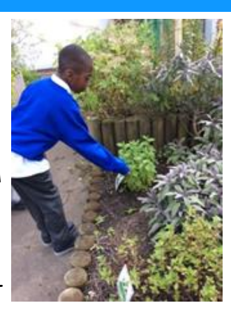
Irwell 5 The children in Irwell 5 have made a really good start to the new term. We have been getting to know our new friends

We went on a plant hunt around our outside area. We used pictures to help us identify the different plants and ticked them off as we found them. We used some fantastic observation skills and really enjoyed ourselves!