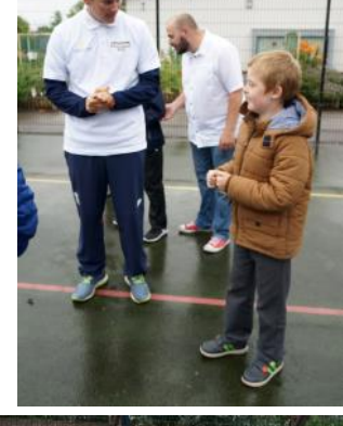
What a wonderful role model for all our children!